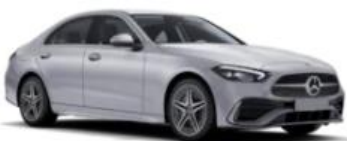
Νέα C-Class Sedan