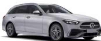
Νέα C-Class Estate