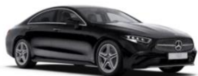
CLS Coupe facelift

Ισχύει από 03-Ιαν-2022 [Αριθμός Πρωτοκόλλου XXX]