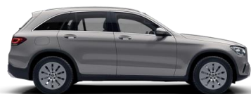
GLC / GLC Coupe facelift

Ισχύει από 03-Ιαν-2022 [Αριθμός Πρωτοκόλλου XXX]