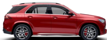
GLE SUV new